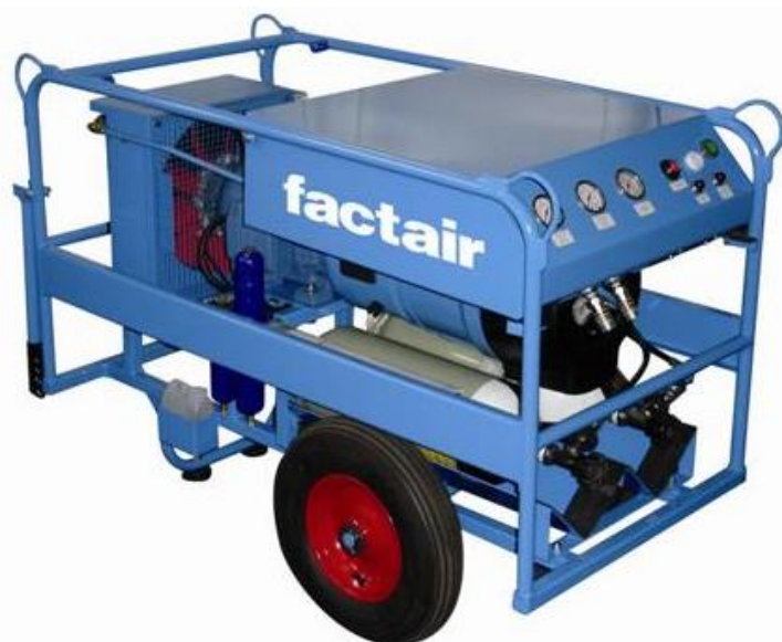
Above - BA450E which incorporates integrated alarm and fail safe reserve.

The BA450E also has a fully integrated automatic fail-safe emergency air back up and alarm system. In the event a drop in the primary air pressure an audible sounder will be activated and the air will continue be supplied from two 9-litre 200 bar (optional 300 bar also available) cylinders. The control panel has a status indicator which in the event of a failure of the primary air will automatically change from green to red and an LED light activated. If the air pressure in the HP cylinders drops below 140 bar this will also activate the alarm and an LED light on the control panel.